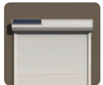
Solar Panel to Pelmet*