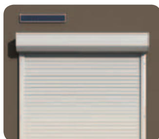
Solar Panel to Wall*