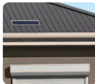
Roof Mounted Solar Panel

The SolarSmart™ Battery Pack may require future maintenance and/or replacement. This should be considered in difficult to reach applications like on the second storey of a building.