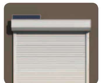
Angled Solar Panel*